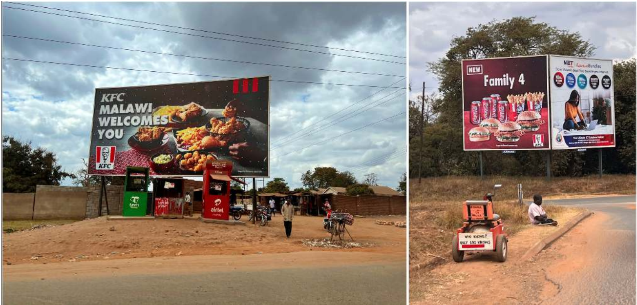
Figure 2. Views from the road, Lilongwe, July 4, 2023