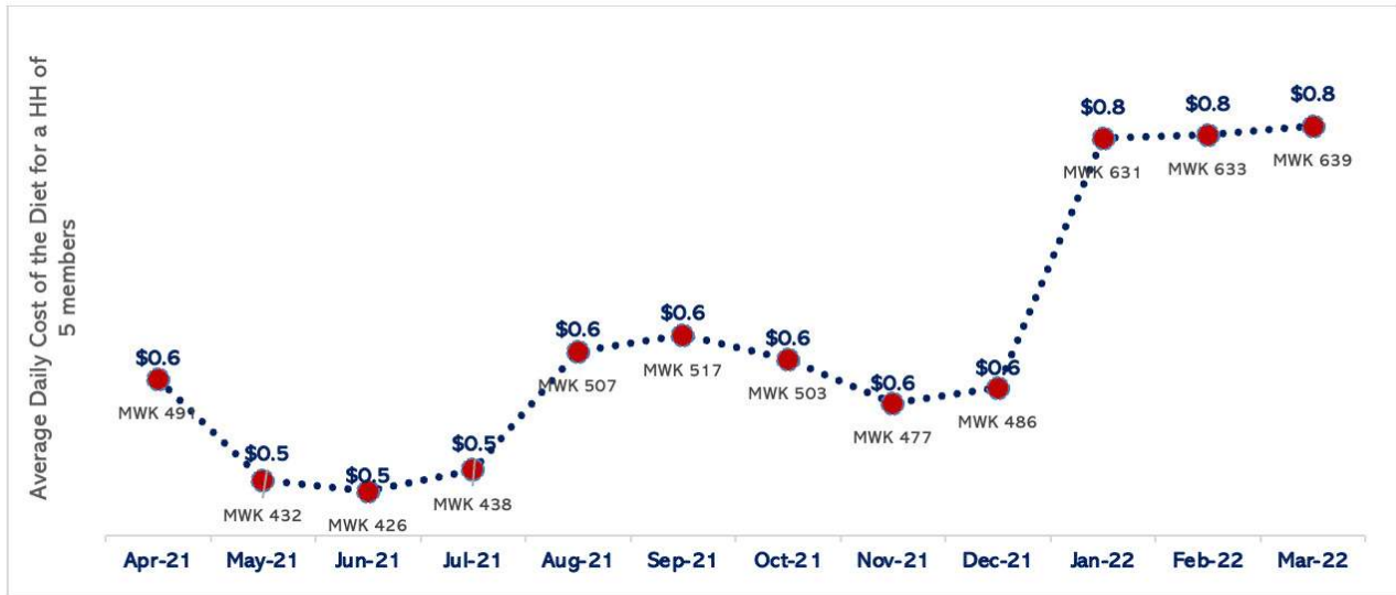
Figure 1. Change in the daily cost of an energy-only (EO) diet for the standard five-person family in Malawi between April 2021 and March 2022