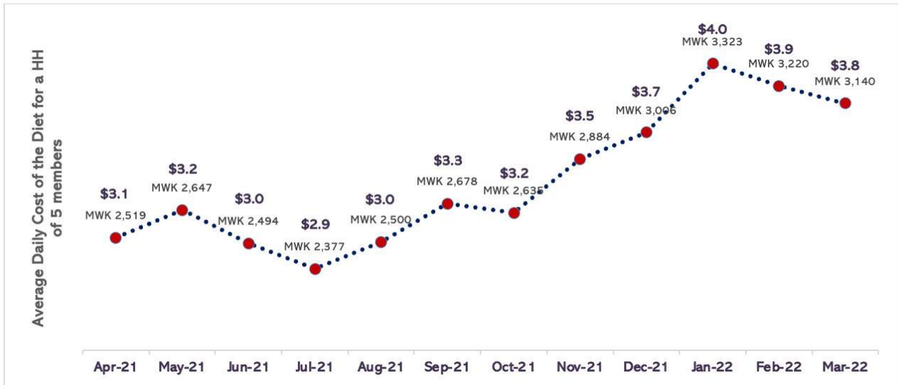
Figure 2. Change in the daily cost of a Food Habits Nutritious (FHEB) diet for the standard five-person family in Malawi between April 2021 and March 2022