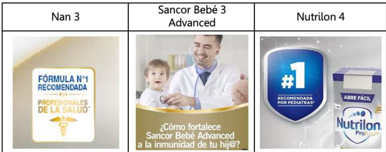
Figure 6. Examples of references to endorsement by health care professionals

the province of Santa Fe (where the Vital infant formulas are manufactured), and the Hygiene and Food Safety Administration of the Governmental Control Agency, City of Buenos Aires, adding that when purchased the product had expired.