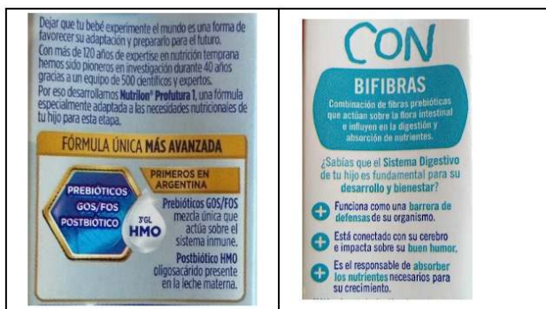
Figure 2. Examples of highlighted optional ingredients included in nutrition and health claims

chain polyunsaturated fatty acids, nucleotides, prebiotics, galactooligosaccharides, fructooligosaccharides, taurine) below the name of the product. These ingredients are considered optional because there is not enough scientific evidence to back up their effectiveness in providing a nutritional or health benefits (EFSA, 2014). In all formulas having optional ingredients, whether or not disclosed below the name of the product, these were highlighted in nutritional claims and, in some cases, claiming a correlation with the health of infants (Figure 2).