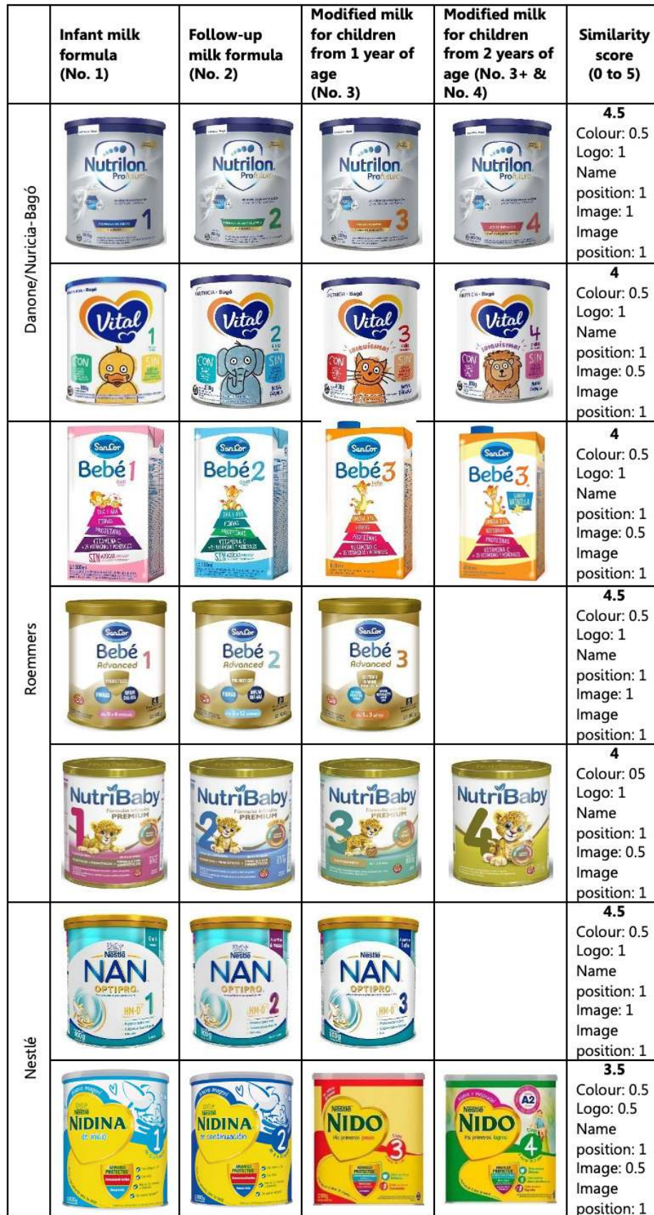
Table 4. Images of containers of infant, follow-up formulas and modified milks for children according to the company marketing the product and the similarity score