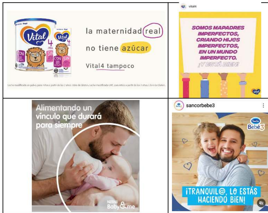
Figure 7. Examples of the use of gender issues as an advertising resource

validity and legality, shielding companies from claims while leaving consumers defenceless. This was the red tape labyrinth that gave priority to corporate business activity over the right to information and to health protection of the population.