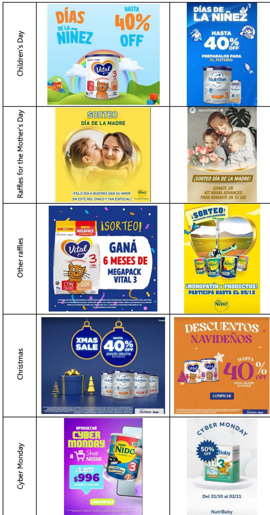
Table 5. Examples of promotions and discounts