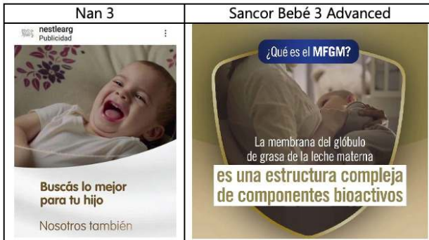
Figure 4. Images of babies in advertisements

textual and visual recognition of the brand and the line of products (Table 4).