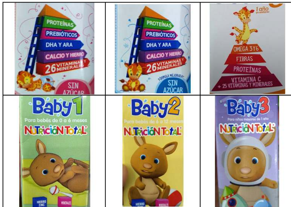
Figure 3. Examples of anthropomorphized drawings

In 71% of the products, there were labels that discouraged breastfeeding, such as: “When breastfeeding is not possible or proves insufficient,” “When the mother is not able to breastfeed her baby, partially or totally.”