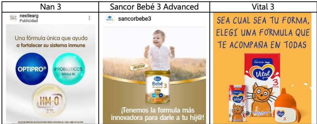
Figure 5. Use of the term ‘formula’ in ads for modified milks