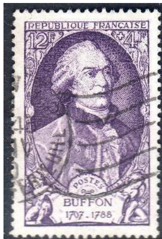
France 1949 Scott B241