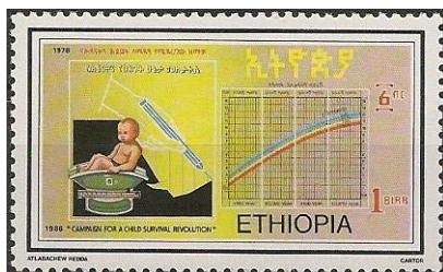
Ethiopia 1986 Sc 1169