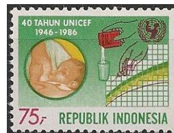
Indonesia 1986 Sc 1288