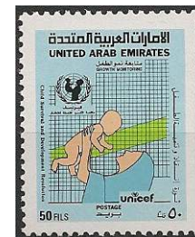
United Arab Emirates 1987 Sc 25