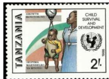
Tanzania 1986 Sc 324