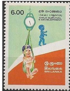
Sri Lanka 1985 Sc 763