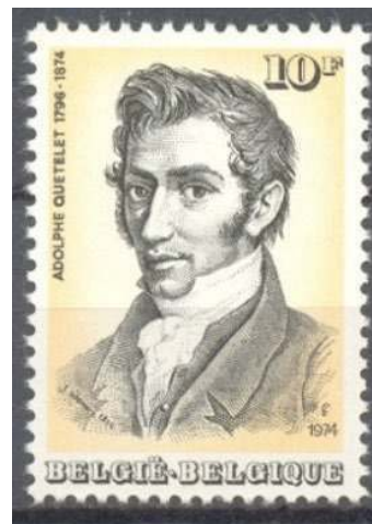
Belgium 1973 Scott 885

(“Scott” refers to the numbering system of the Scott Catalogues of postage stamps.)