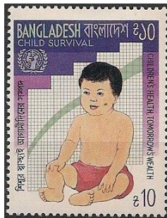
Bangladesh 1985 Sc 258

The stamps below feature single values from each of their respective sets on the theme of child survival, selecting for stamp(s) that depict growth curves.