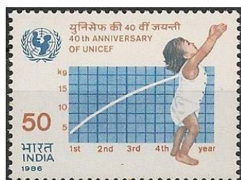
India 1988 Sc 1132