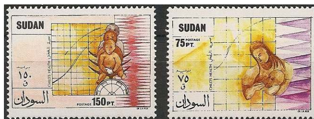
Sudan 1988 Sc 359