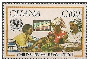
Ghana 1985 Sc 1000