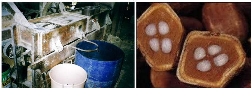
Two more ingredients of multimistura. Coarse flour made from rice bran in a 50-year old machine (left), and (right) my addition, pulverised mesocarp of the babacu palm fruit, exclusive to Amazonia

mixture contains myriad bioactive substances that are either not classed as nutrients, or whose properties are not well known, or else are unknown and thus ‘off the map’, all in a natural balance. Tolerant people object to rigidity, believing that makers of multimistura should feel free to use what is available including in different regions and seasons. This makes the mixture adaptable for formulation and use in other countries.