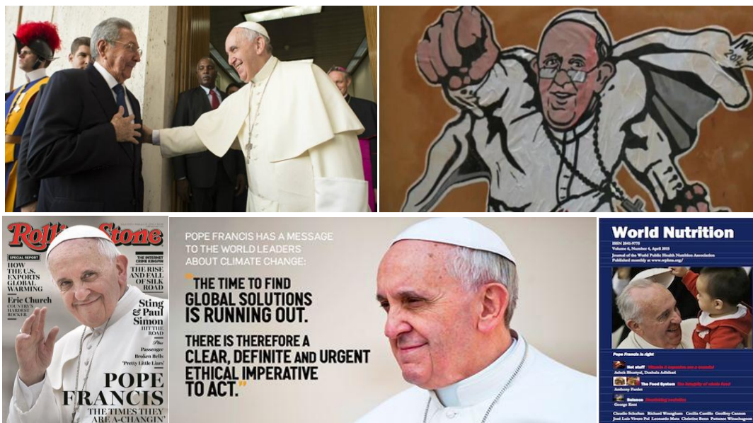
Pope Francis greeting Cuban president Raul Castro at the Vatican (above left), portrayed in street art as a superhero (above right), calling for action on climate disruption (below middle), and on the covers of magazines like Time and Vanity Fair , and (below) also of Rolling Stone – and World Nutrition

Pope Francis is now the world's most powerful moral authority. In the Forbes list of the world's most influential people he ranks #4, after the leaders of Russia, the US and China. He eclipses all previous popes in modern times by his direct words and actions, his guts in taking on the biggest issues, and his personal humanity. With 1.2 billion Catholics in the world, and with his homely universally attractive charisma including for those (like me) without belief in a God, he has real impact. Also, at 80 next year, he is an old man in a hurry. If any one person, buoyed by an emerging spirit of the new age ahead, could be our good shepherd, it is Francis.