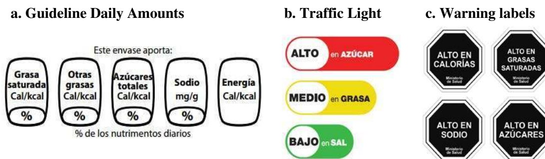
Figure 1. Types of Front-of-pack nutrition labels assessed in Argentina, Chile, Costa Rica, and Mexico

In 2014, the Ecuadorian government implemented a mandatory policy to use the FOP TL, also used by the United Kingdom (Ministry of Public Health Ecuador 2013). During the same year, Mexico introduced the GDA system as mandatory (Ministry of Health Mexico 2014). In June 2016, Chile mandated all packaged food and beverages with high content of saturated fats, sugar, or sodium to display a FOP WL (Ministry of Health Chile 2015). Since then, a growing number of countries have been implementing the WL system, including Peru (Michail 2019b) and Uruguay (Graña 2018). Most recently, in 2019, the Mexican government approved a law to replace the GDA with WLs (Sherman 2019). Other countries in the Latin American region have developed recommendations to the government (i.e., Brazil) (Khandpur et al. 2018) or are having discussions in their congresses (i.e., Argentina and Colombia) to implement the WL system.