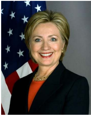
Hillary Rodham Clinton US Secretary of State Website: www.state.gov