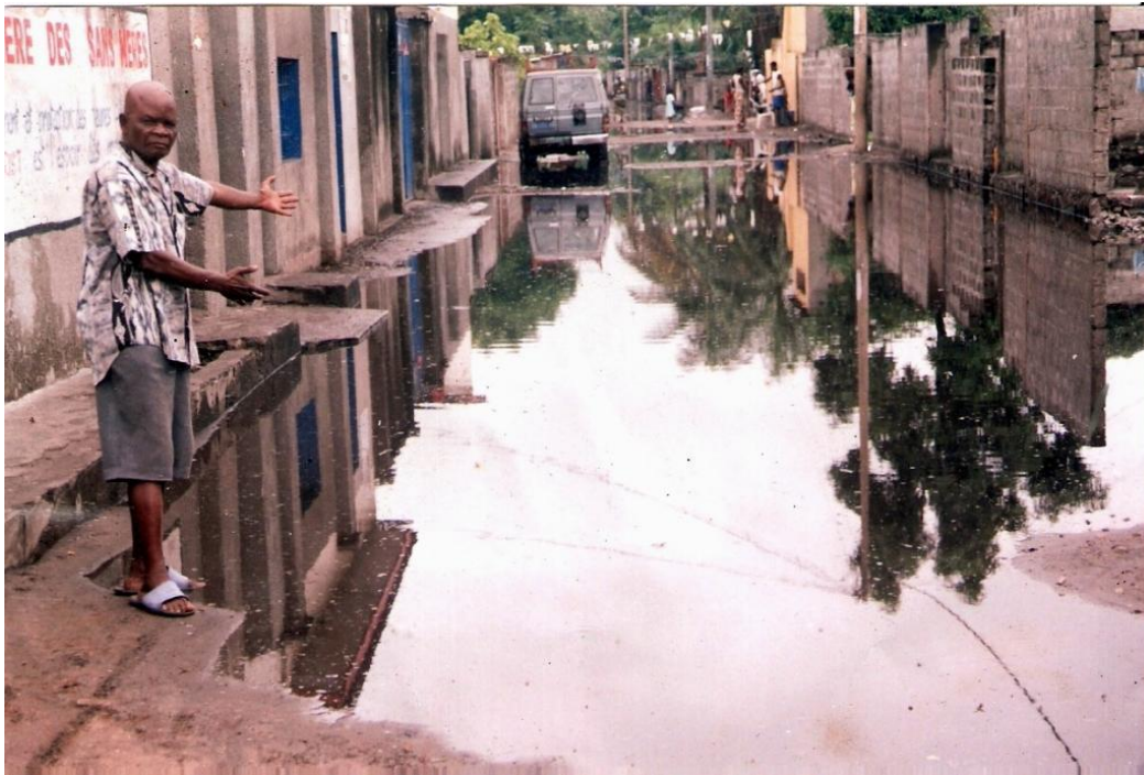
Schuftan C.I go to Kinshasa [Column]. World Nutrition , April 2012, 3, 4

The number of active members goes from 50 to 300. They meet in assembly every two months. Every committee has established working groups given specific tasks. There is a 'reflection group' that analyses the problems from a local and national perspective, while at the same time keeping in mind the potential of the community to follow a process of empowerment, and to document changes over time. There is an organised group of children. They perform street theatre. There is a sanitary brigade. They collect rubbish from homes and from the streets. There is a group of mothers called 'Bopeto'. They go house to house to make sure home hygiene is kept. There is a group of 'health militants'. They also do house to house work, but for preventive health issues. And more, and more! There is a women's cell; a circle of youth; school health committees run by pupils; a water and electricity committee; a popular library; and a people's electoral committee that handles civic and political issues.