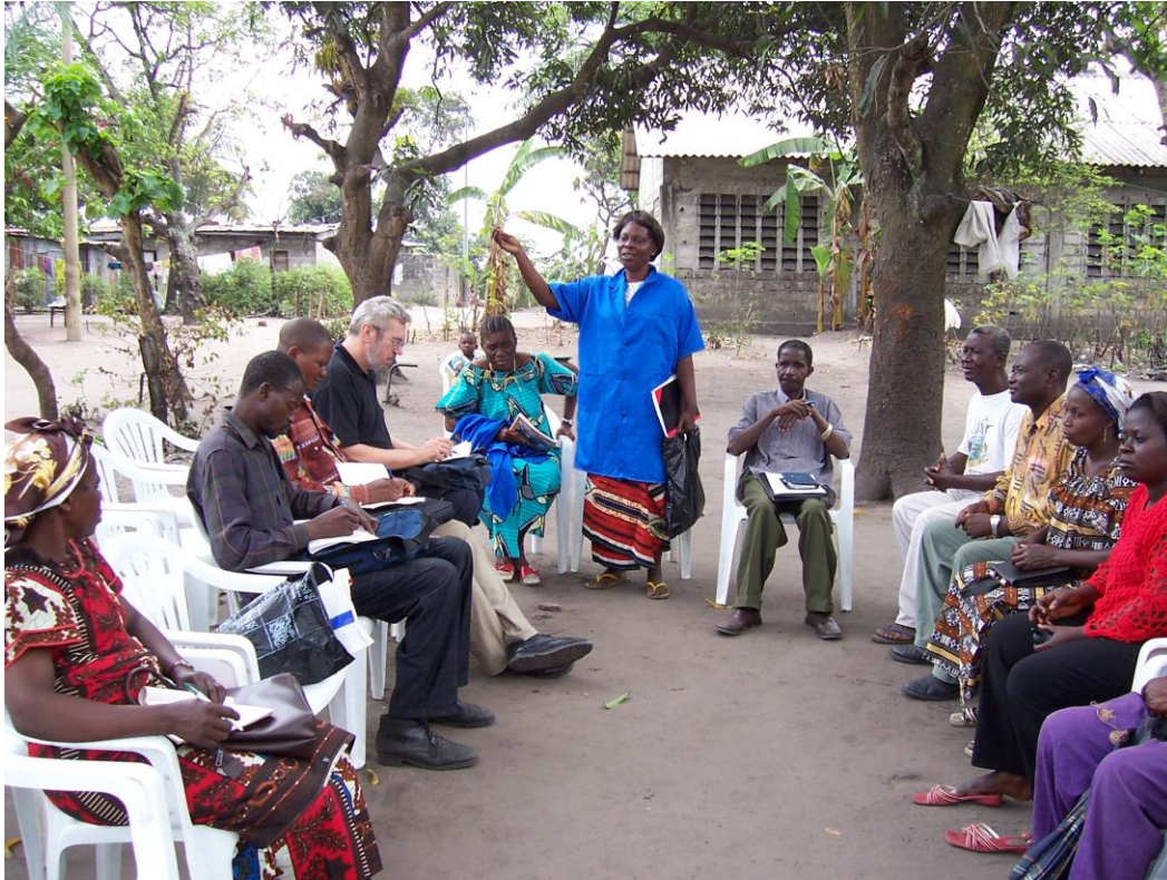
Top: quartiers in the city with very little infrastructure, before cleaning by the people's health committee workers. Above: here is a meeting of a people's health committee, planning local action

Training is offered by my host organisation, using ad-hoc modules. Topics include preventive health issues, right to health issues, and mobilisation and advocacy techniques. Special emphasis is given to raise consciousness of the meaning and implications of the deeper causes of preventable diseases, malnutrition and death. Great emphasis is given to cleaning up the neighbourhoods. I forgot to mention in sketching the dark side of Kinshasa, the depressing sight of filth in the quartiers : plastic pollution, rubbish, stagnant water pools, served water dumped in alleyways. I noted that two of the three quartiers I visited that have longer-established committees have much cleaner alleys than the others I drove or walked through. Other achievements include a successful child deparasitation campaign, a cholera prevention campaign, and participation in the government's immunisation campaign.