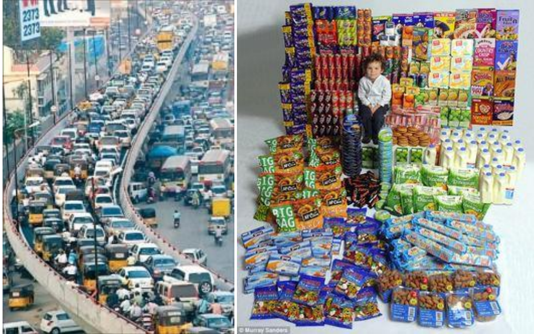
Traffic jam in Bangalore, India (at left); ultra-processed products and other energy-dense food consumed by British 4-10 year-olds in a year (at right)

The commercial drivers of the obesity epidemic are so influential that obesity can be considered a robust sign of commercial success – consumers are buying more food, more cars, and more energy-saving machines (1). It is unlikely that these powerful economic forces will change sufficiently in response to consumer desires to eat less and move more, or to corporate desires to be more socially responsible. When the ‘free market’ creates substantial population detriments and health inequalities, government policies are needed to change the ground-rules in favour of population benefits.