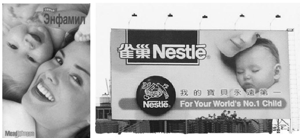
Violations of the Code of Marketing of Breast Milk Substitutes: advertisements promoting infant formula feeds in Russia, 2001 (left) and Taiwan, 2002 (right).

The pictures below give a glimpse of what those who advocate breastfeeding are up against. These are of advertisements in 2001 and 2002 for baby formula in Russia and Taiwan that break the UN Code of Marketing of Breast Milk Substitutes, twenty years after it was adopted by the WHO World Health Assembly in 1981 (1). How on earth can civil society organisations largely made up of volunteers, monitor and check such practices, given the colossal scale and power of leading baby formula and feed manufacturers of which one – Nestlé – is the biggest transnational food and drink manufacturer in the world? With difficulty, is one answer. Because their cause is clearly righteous, is another – except it needs to be remembered that not so long ago, artificial baby formulas were commonly seen as equal to or even superior to breastmilk. What is now the universally accepted perception that ‘breast is best’ did not occur by chance.