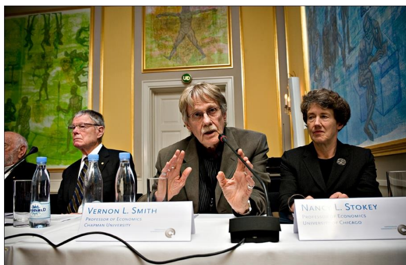
2012 Copenhagen. Economic Nobelist Vernon Smith emphasises a point, watched by Nancy Stokey. Also in the picture, left, is Thomas Schelling

They were convened in Copenhagen in May with a challenging brief to 'change the game'. They were asked to judge what major benefits to society would emerge if they could decide how to spend an additional $US 75 billion, which is 15 per cent on top of the current total global aid budget, over a four-year period. They evaluated the evidence from the challenge and other background papers. They sat with technical and other expert advisors and reasoned together, as in the picture below, which shows Vernon Smith of Chapman University, California, making a point, watched by Nancy Stokey of the University of Chicago, with Thomas Schelling, previously of Yale and Harvard, now of the University of Maryland, also in the picture.