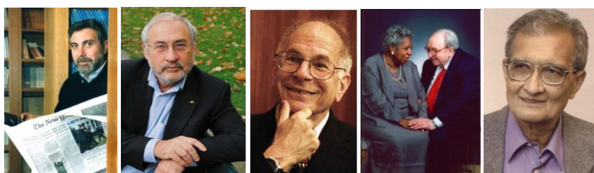
Paul Krugman, Joseph Stiglitz, Daniel Kahneman, Robert Fogel (with wife), Amartya Sen: Nobelists not engaged in the Copenhagen Consensus process

There are other more broad-minded economics Nobelists who could have judged the evidence and also advised on what evidence is most relevant. Five, all now based in the US, are pictured below: Paul Krugman, Joseph Stiglitz, Daniel Kahneman, Robert Fogel, (pictured with his late wife), and Amartya Sen (former Master of King's College, Cambridge). Such a panel might well have had a more lively discussion and come up with more imaginative lists of priorities. Indeed, such a panel would almost certainly have challenged some of the principles underlying the Copenhagen Consensus process.