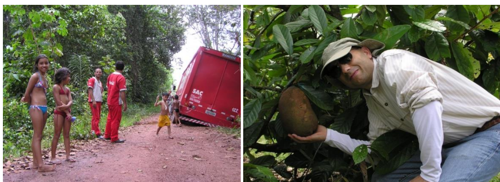
A time in the Brazilian jungle. The Coca-Cola truck blocking our progress (left), and (right) a Pepsi marketing exec in search of the low-hanging fruit