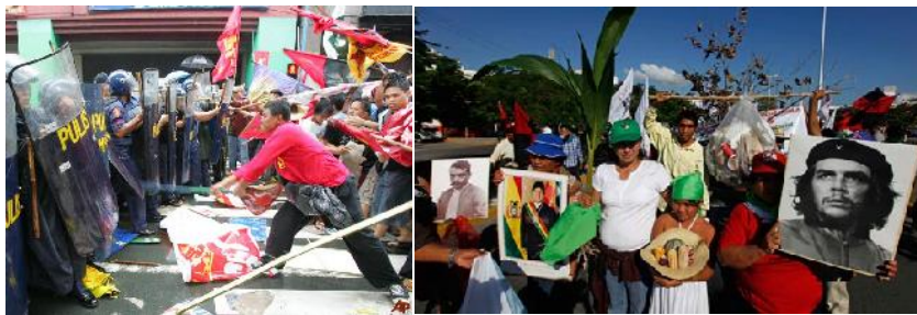
Manila, 2012 (left). Farmers protesting against landholders. Cancun, 2010 (right). La Via Campesina marchers with Latin heroes , on climate change

JD You said that the struggle for food sovereignty requires a different strategy of alliances. How does La Via Campesina consider agreements with non-governmental organisations, including those concerned with national and international development?