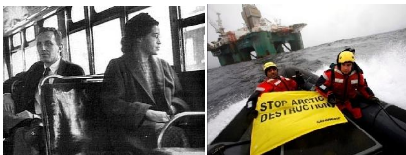
Later 20th century direct action: Rosa Parks bussing in a 'whites only' seat in Alabama, in 1955 (left); Greenpeace challenging Arctic oil drilling (right)

The types of action exemplified by Rudolf Virchow and John Snow continued into the 20th century. Thus in Britain beginning in 1912, campaigners for votes for women, chained themselves to railings, set fire to letterboxes, and smashed windows, as a result of which (above, left) they were liable to be imprisoned, where they went on hunger strikes and were force-fed. Mohandas (Mahatma) Gandhi led the 1930 Salt March in defiance of the British Raj laws monopolising production of salt (above, right), as a result of which he was imprisoned. These direct actions were an essential part of the movements that eventually secured full citizenship for British women, and gained Indian independence from British rule.