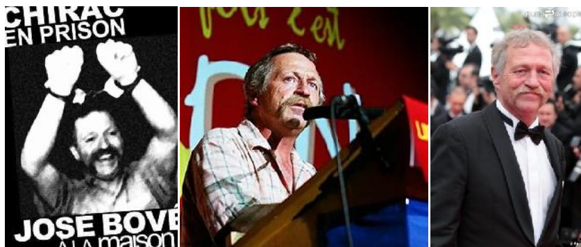
José Bové, French cheese producer, in handcuffs on his way to prison (left), on his political platform (centre), and at the Cannes Film Festival (right)

Rainbow Warrior to protest nuclear trials. Also in 1995, he led protests attacking French government offices, smashing windows, setting fires and charging local police office gates with tractors. Since 1997 he has been implicated in the destruction of a Novartis seed production facility'. As a result of the McDonald's event, in 2002 he was sent to prison with a sentence of three months, which after denunciations from his admirers, rumoured to include then French president Jacques Chirac, was reduced. In 2001 he published a manifesto against malbouffe (junk food) (4). He gained almost half a million votes as a presidential candidate in 2007, and is now a member of the European parliament.