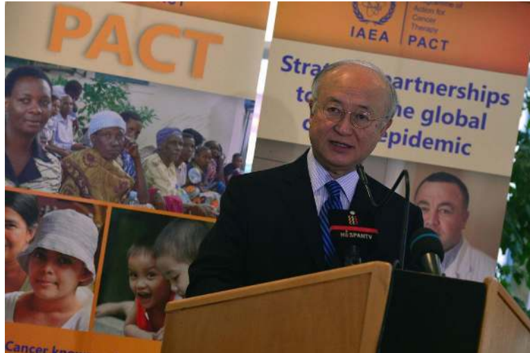
Here is the director-general of the International Atomic Energy Agency, Yukiya Amano , delivering his address during the 2013 World Cancer Day

radiotherapy machines in low-income countries. Too many people in these regions die of conditions that are treatable. He said that his agency, set up to promote the peaceful uses of atomic energy, is undertaking over 130 projects in cancer diagnosis, management and treatment in Africa and has supported low-income countries to the tune of $US 250 million in the past three decades.