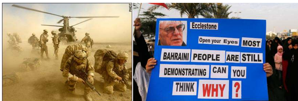
Afghanistan. The invasion continues, the war drags on (left). Bahrain. The Formula 1 race deal is seen by protestors as a cover for corrupt government