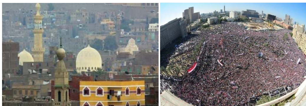
Cairo. From tranquillity to turmoil. A city of mosques (left). (Right) The cauldron of up to a million people celebrating the fall of president Mubarak