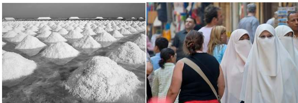
Just some of the annual global production of 200 million tonnes of salt (left). Middle Eastern culture can be very different from that of the West (right)