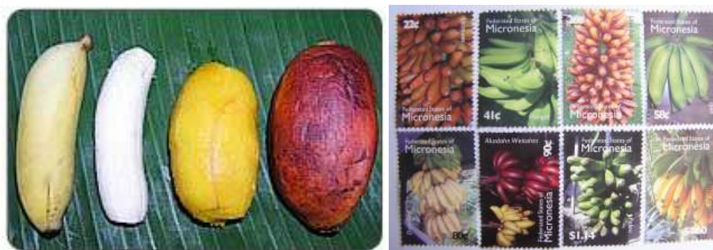
The more deeply pigmented a banana, the greater its content of carotenoids (left). (Right) stamps issued by Pohnpei to celebrate its indigenous foods