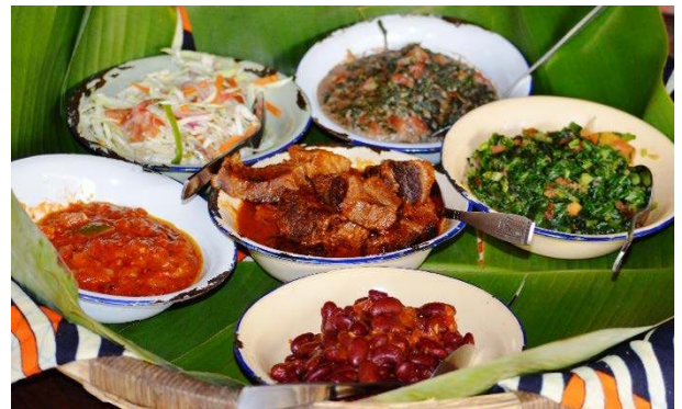
Figure 1: A feast of nutritional diversity at Kumbali Cultural Village in Malawi, Africa

According to the Food and Agricultural Organization of the United Nations (FAO), research has identified approximately 250,000 plant species out of an estimated 300,000-500,000 in existence. Of that, about 30,000 are edible, and of these about 7,000 plants and an additional 700 animal species have been used throughout the world's history as food. Today, however, only 3 plants (wheat, rice, and maize) provide more than half of the global plant-derived energy. If we add 6 more crops (sorghum, millet, potatoes, sweet potatoes, soya beans, and sugar (cane or beet) we cover 75% of the world's energy. And, if we go a bit further, it is estimated that 95% of the world's dietary energy comes from only 30 crops. 1