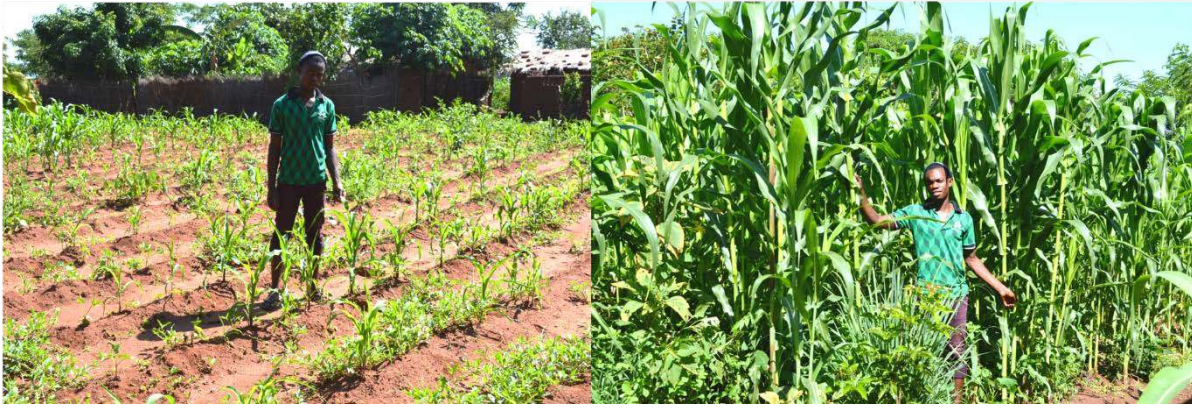
Figure 6: Local Malawian farmer, Chiku Zamula, standing in two different systems of agriculture during Malawi's 2016 'drought'.