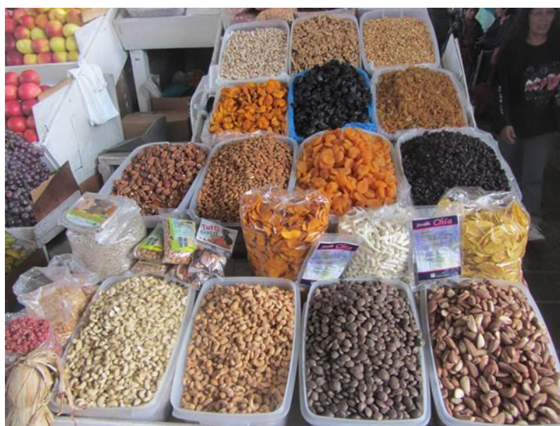
Dried fresh produce in an open market including beans, fruits and nuts, Mexico

To ensure that we all have plenty to eat, and of the best quality, we need to do three basic things. First and foremost, we must grow plenty of staples – cereals, pulses, and tubers – in general on the field-scale, which means by arable means. Then, to make sure that we have all the right minerals and vitamins and plenty of flavour, we need to practice horticulture virtually on the biggest scale that the land can support.