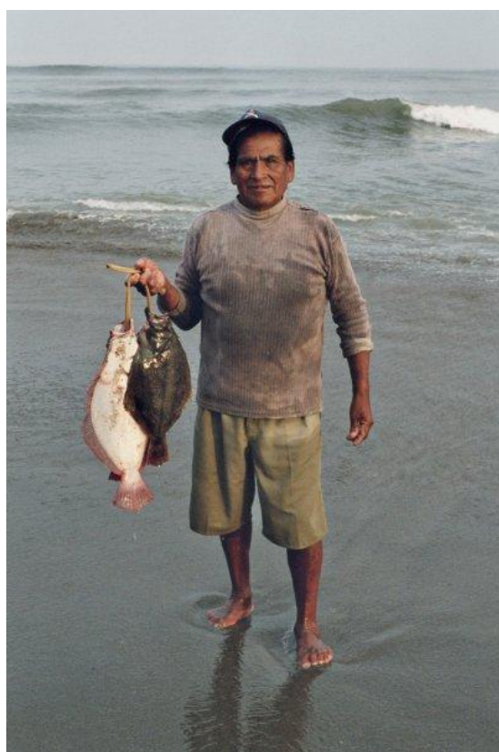
Fresh fish from the Pacific Ocean offered by the fisherman on a beach in Peru

All we really lack is will. We could already afford, easily, to do all that needs doing. Indeed all we really need to ensure that everyone in the world is well fed, forever, and to achieve this without exterminating other species or wrecking the world as a whole, is to design agriculture specifically for that purpose. For this we already have the know-how. This is the accumulated wisdom of the past 10,000 years, abetted by appropriate science. Farming that is designed expressly to provide good food for everyone without wrecking the rest of the world I have called ‘Enlightened Agriculture’, which I and all the friends and colleagues who are with me in this adventure is sometimes shortened simply to ‘Real Farming’.