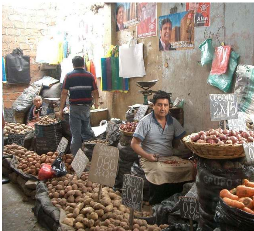
Here is where potatoes originally came from. Some of the many varieties in a potato market in Peru

So there’s a lot that can go wrong. Even so, the most robust demographic projections now tell us that if we can feed 9.5 billion people, and continue to do so for a few decades or centuries, then after that the problem will get easier. In other words, the 9.5 we should reach in 40 years is as bad as things ought to get. At present it seems that Malthus was wrong: the problem of population growth is not open-ended. It can be seen to be finite. This is the best news that planet Earth has had since human beings started farming on an appreciable scale at the end of the last Ice Age, around 10,000 years ago.