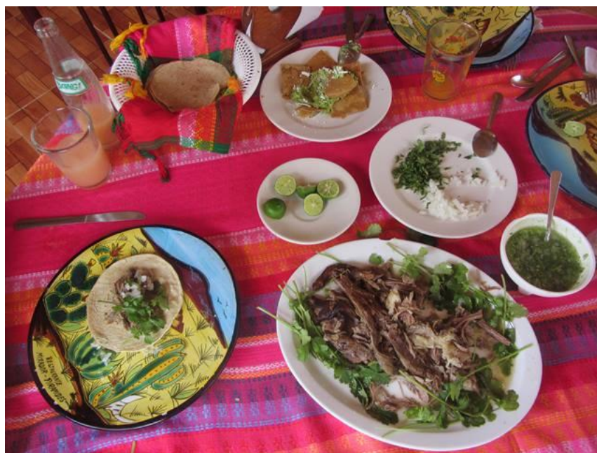
A delicious meal of traditional dishes made from local produce, Mexico

Enlightened Agriculture and all that goes with it is conceptually straightforward, and obviously suited to our needs. So why have the powers-that-be chosen to do the precise opposite? I answer this question in World Nutrition next month, July.