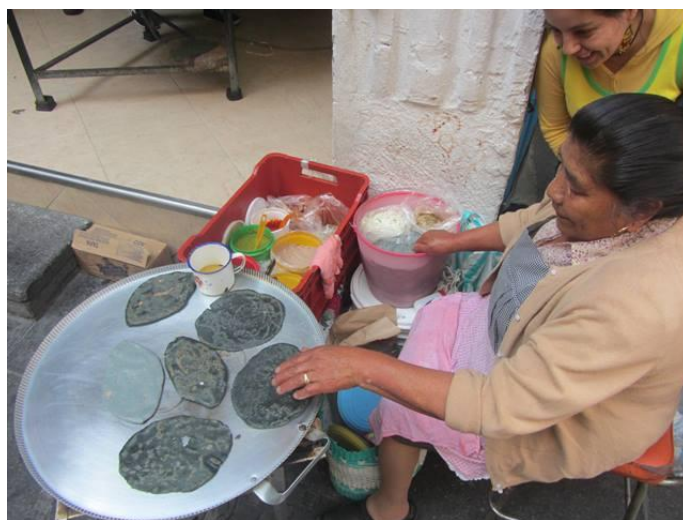
Making tortillas the traditional way for sale in a street market, Mexico

In fact, the precise opposite. Enlightened agriculture is also for gastronomes.