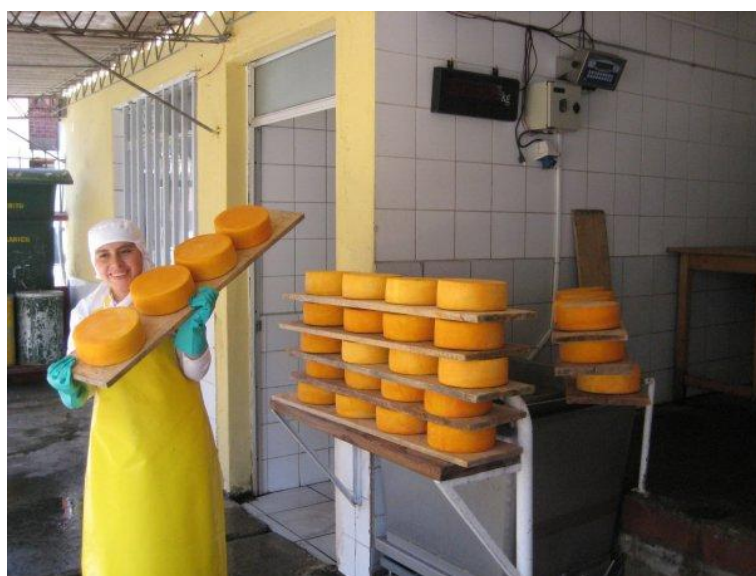
Making cheese using modern methods at a small dairy farm, Ecuador