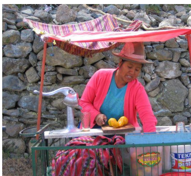
Orange juice squeezed immediately on the spot, on sale from a street vendor, Peru

Wild ecosystems on the whole are low-input. At least, all ecosystems borrow from other ecosystems – all of us, for example, breathe oxygen that may have been produced far away by oceanic diatoms – but all in the main must make use of what's available. Wild ecosystems do not use fossil fuels, or drill or mine for minerals. They get their energy from the Sun and they get their nitrogen, vital component of protein and nucleic acids, mostly from the air. The Sun will last a very long time and all the components of the atmosphere are assiduously re-cycled.