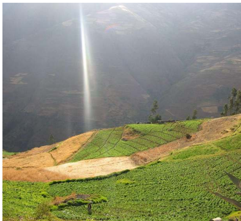
A sun-ray shines on an originally ancient upland agricultural landscape in the Peruvian Andes