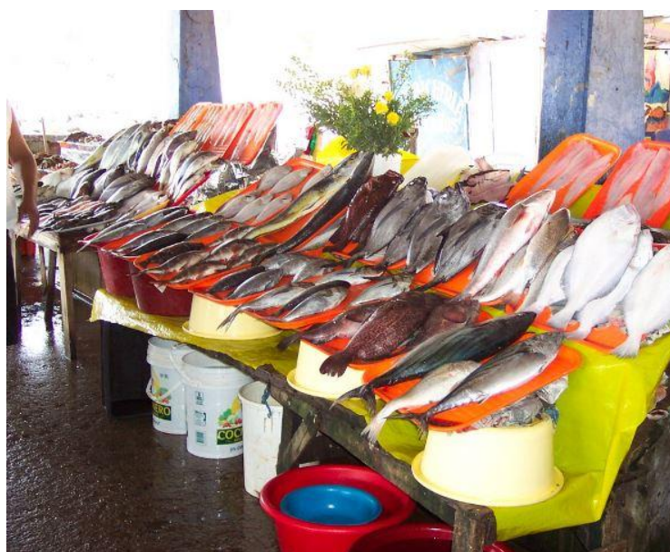
An open-air market for many species of fresh fish from rivers and the ocean in Peru

Lord Acton observed that all power corrupts. Aldous Huxley asked mischievously whether the British government of his day was wicked or merely stupid. George Orwell warned us to beware of intellectuals in general, for ‘no ordinary man’ could be as silly as they can be. All should be heeded. For there is a quite different way of looking at the world’s problems.