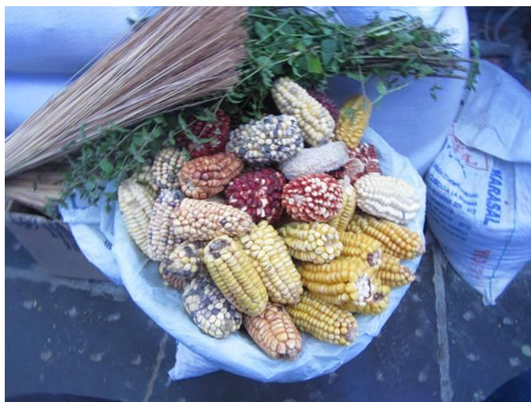
Varieties of corn, worshipped as the origin of life by the Mayans, still grown in Mexico

No-one who understands the way the world works can fail to see the logic of all this, say the powers-that-be. Those who object to the new technologies and the 'free market' are idiots, or else deluded (harbouring false memories of some golden past that never was), or are subversives with suspect political agenda of their own.