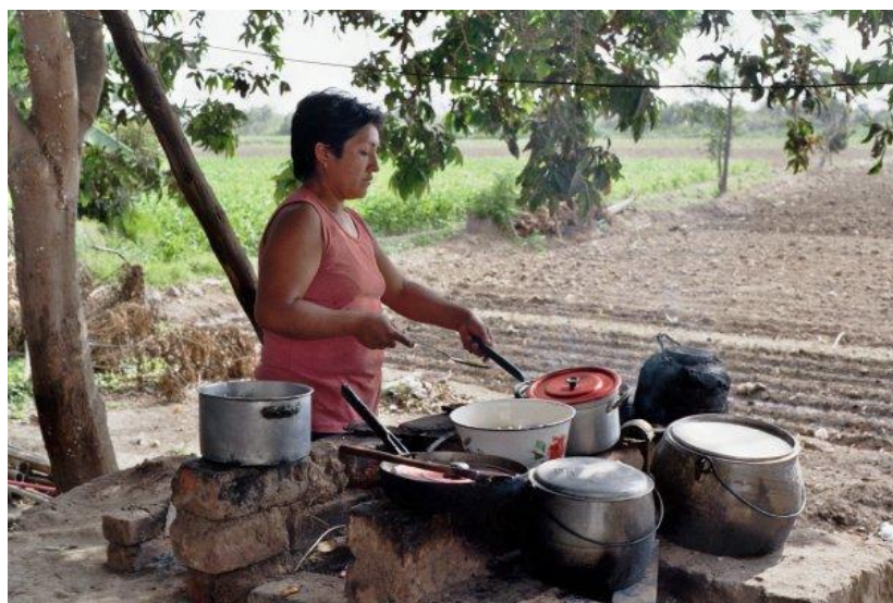
The women of the house preparing lunch for workers on the farm, Colombia

We cannot just impose Enlightened Agriculture. If we want it to become the norm, then we would need to re-think the present world's entire food strategy – insofar as any strategy can be discerned. At present, the finance- and profit-driven market marches to the drum of the late 18th/early 19th century English economist David Ricardo. (Much of modern thinking comes straight from the Enlightenment). Ricardo introduced the principle of 'comparative advantage'. This means that every country should strive simply to produce whatever it is best at producing, and then seek to sell what it's good at to other countries for the highest bidder. In short, all crops and animals are conceived not primarily as food, but as commodities.