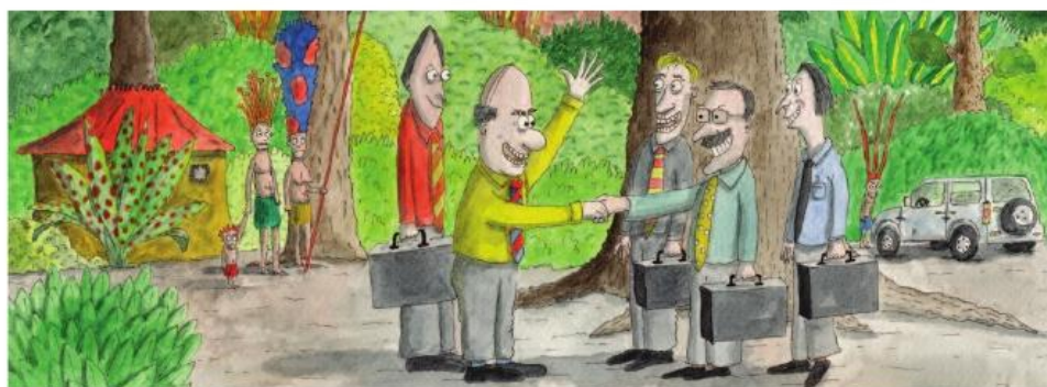
So we opted for a Multi-Stakeholder Cross-Disciplinary Integrated approach.

Access March 2013 WN editorial on fortification and DSM here