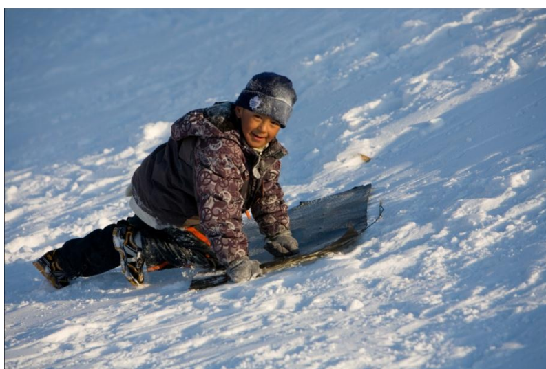
An Inuit boy enjoying the outdoors.

The Inuit Peoples live throughout the Arctic region. The Inuit community of Pangnirtung on Baffin Island is the locus of research and activities in this project to promote traditional Inuit foods. Using radio and film media, education of youth on traditional foods described by Elders has been broadcast. With support from the Baffin Region health promotion office in the Government of Nunavut in Iqaluit, and the Inuit Tapiriit Kanatami based in Ottawa, the programme activities have been broadly communicated, along with the concerns for climate change effects on availability of traditional food species and impact on food security. Community and project leaders have spoken at many international conferences and United Nations sponsored meetings about the impact of climate change on traditional diets in the Arctic.