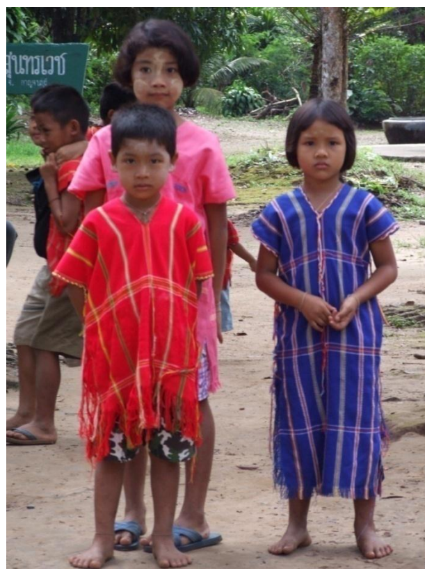
Karen children.

The Karen People live in Thailand and in Myanmar (Burma). In Thailand, Karen community leaders and research partners at Mahidol University work closely together to promote traditional food culture and world-views by increasing the agriculture of traditional food species. With focus on women and young children and strengthening capacity of local leaders and youth, change agents have spoken eloquently in the Karen and Thai languages in national and international conferences. Important to their success is the involvement of interdisciplinary and multi-sectoral stakeholders with community priority at the local level, and through sharing among related networks, in local and national media as well as national and international conferences.