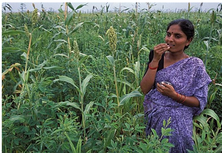
Dalit assistant sorting edible greens.

The intervention was conducted and evaluated in a select number of communities in the Zaheerabad region in Andhra Pradesh, Southern India (see map above). The Deccan Development Society (a non-government organisation) works with sanghams, organizations of Dalit ('untouchables' in the Hindu religion) women farmers in this region. The overall objective is to enhance food security for Dalit families with many outreach activities emphasising organic agriculture that cultivates their local food species. A significant activity is to negotiate funding to cultivate fallow land (2,675 acres to date) for management by the impoverished and illiterate women, and distribution of the resulting traditional grains (for example, sorghum, millets) within their communities, as well as creating job opportunities. The Deccan Development Society continues to develop awareness for using the local foods, using films, local radio, cooking classes, food festivals, provision of local foods in meals for day-care centres, and other activities. Now there are more than 3,600 families in 75 villages in Andhra Pradesh participating in these activities. Media distribution has been extensive;