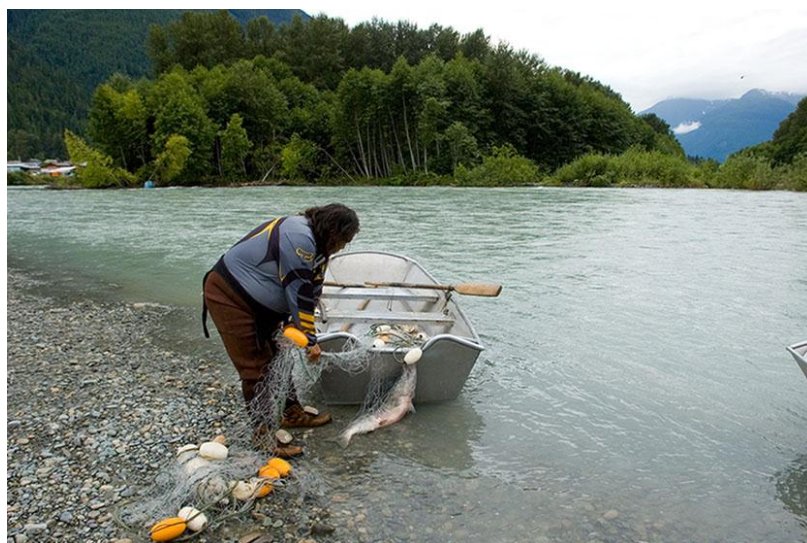
Fishing in the Bella Koola river.

The Nuxalk Peoples are one of the First Nations living on and near the Canadian Pacific coast. Its Food and Nutrition Programme was conducted more than 20 years ago, as the first programme of its kind in Canada. Nuxalk community leaders and academic partners worked together to improve several aspects of traditional food use, nutrition and health. The results of the programme have been shared with many similar programmes developed to improve access to traditional foods by First Nations Peoples, and have been an inspiration for international work. The Food Security reference group meets regularly now to promote traditional food use. The traditional food and recipe books created by the programme have been reprinted many times, and are still in use in the community schools as well as more broadly in universities and among other Indigenous communities. Some traditional foods promoted by the original project – especially the ooligan fish – are now environmentally threatened. The original nutrition and health data have been used to raise awareness for their protection. The Nuxalk community hosted a conference on ooligan conservation in 2007. Many activities stressing the success of the programme now involve First Nations in British Columbia, and nationally and abroad.