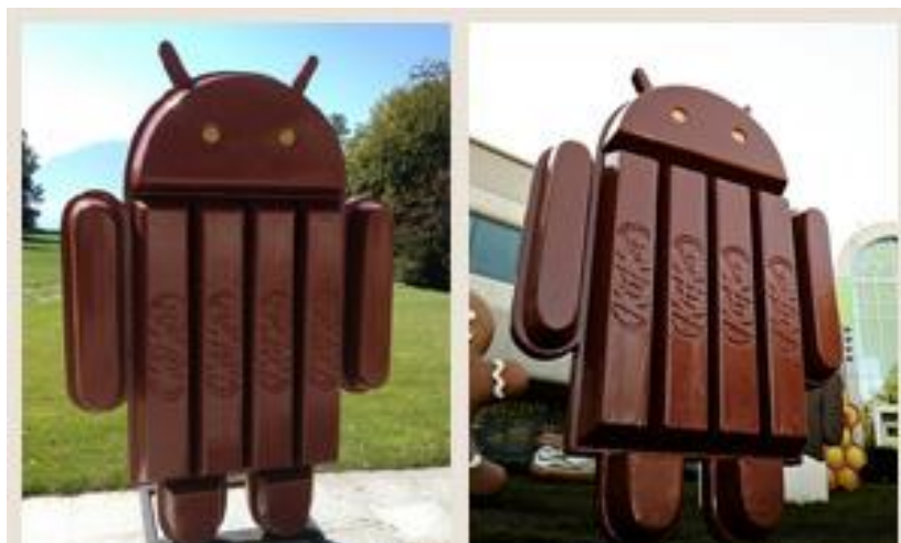
Here are Android KitKat® statues on the lawns of Nestlé's headquarters in Vevey, Switzerland (left) and of Google's campus at Mountain View, California, US. The snack bars have landed!

Here is a whole new development involving two different types of transnational corporation. Last September Google announced that version 4.4 of its Android mobile operating system would be called KitKat®, a name owned by Nestlé. The deal is that no money changes hands. Instead, a promotion was dreamed up in various countries with specially branded Android KitKat® candy bars (see above) to win. The contest ran until mid-November, except in the US where it continues to the end of January. Obviously the two corporations are excited: see above, the chocolate-coloured munchable sculptures on their lawns in Europe and the US.