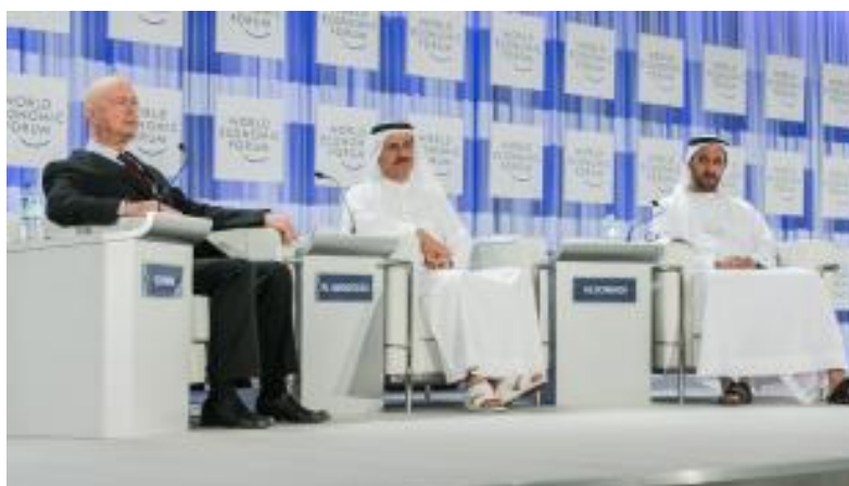
Abu Dhabi (top), location of the 18-20 November 2013 meeting of the World Economic Forum at which its global agenda for 2014 was set. Klaus Schwab (above) at the opening plenary session