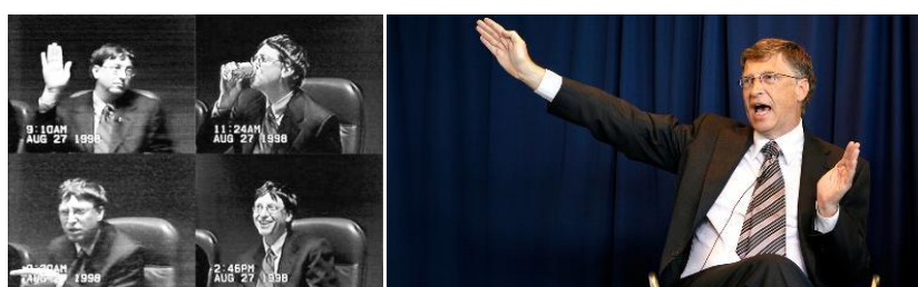
Bill Gates giving his deposition and testifying in 1998 at the US judicial hearing on Microsoft monopolistic practices, at left. At right, he is in full flow at a meeting held to plan saving the world

As I said in the previous issue of WN , the Gates Foundation's very large holdings of shares in Coca-Cola and McDonalds (1,3) identify it as a multinational corporation, albeit run not for profit, which to me aptly puts it in the category of Big Food. Most people agree, some with regret, that the world needs philanthropy and charity. But are justice, equity, human rights and world health served by philanthrocapitalism as practiced by the Gates Foundation? This is a whole different question.