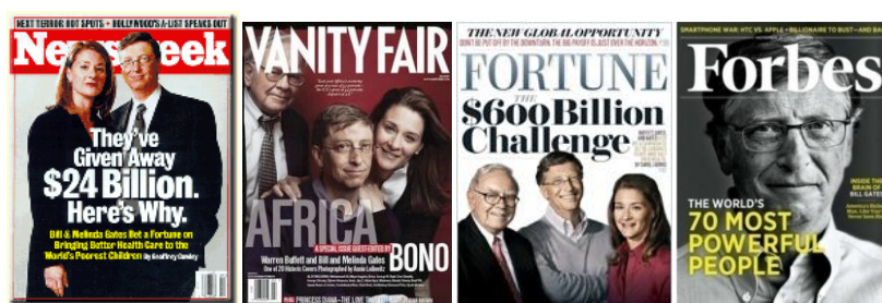
Four more Bill Gates covers, three with Melinda Gates, and two with Warren Buffett, published (left to right) in 2002, 2007, and 2010; and Bill by himself up there with heads of state in 2011

Bill Gates has personal direct command of more money than anybody else in the world. For 30 years he has also been exceedingly powerful and famous, first featuring on the cover of Time magazine in 1984 (pictured below) and at least 10 times in all. The covers of other magazines shown above, seek to explain the Bill and Melinda Gates Foundation (2002); explain his plans to transform Africa and China (2007 and 2010); and position his place in the world as estimated by a leading US money and power journal (2011). Foreign Policy magazine has made him with Warren Buffett the number 1 'global thinker' for 'preaching a breathtaking new gospel of how capitalist riches can solve the world's problems... as the world's states falter' (4).