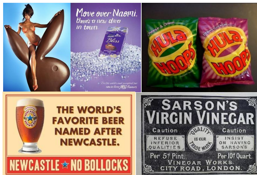
Cadbury was taken over by Kraft in 2010. Hula Hoops were bought by Intersnack in 2012. Scottish and Newcastle went to Heineken in 2007. Sarson's was snapped up by Mizkan

What is consumed though is, in the trade's language, not just the steak but also the sizzle. Ultra-processed products must make the consumer feel good with tastes that are instant, constant and uniform. But to be very big business they must also make consumers get the impression that they live, belong and are potent and attractive in a wonderful world. That's where branding and promotion comes in.