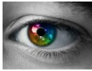
BIG FOOD WATCH