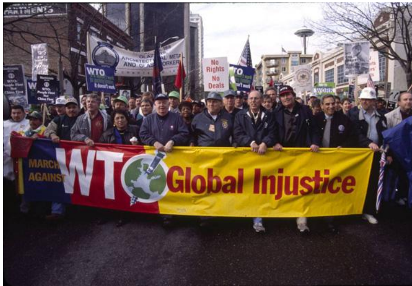
Seattle, 1999. Some of the great issues of food sovereignty and security and the rights of producers and consumers are not just for study. They are, like this or not, being faced and fought for on the streets

Our struggle requires a deep commitment to justice, fairness and human rights. In our current world, producers and consumers of food are by right, claim holders. So, what cannot be forgotten when discussing food systems is precisely the role of these as de-facto claim holders. A deliberate focus on empowering them – with a special focus on women and activists in this field – is thus needed. Here, allow me to mention the role of World Nutrition in the last two years. The journal has become a unique resource for all of us struggling to discern the forces at play, including those of us dedicated to fulfilment of the true vision, mission and work of public health nutrition