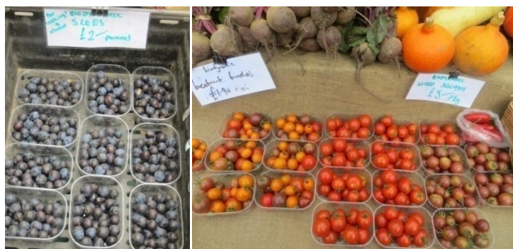
Sloes (left) and varieties of small tomatoes with beetroot and squash in the background (right). These cost less in supermarkets, but I prefer to support growers' families than corporate profits

As a citizen, disturbed about how my country and the world are governed now, I feel at home in the market, and sense hope for the future. The sellers and buyers here are working out ways to live wisely and well, based on a vision of human-scale, inter-connected and locally run. We are members of a community, which includes responding to street dwellers who occasionally seek coins or food.