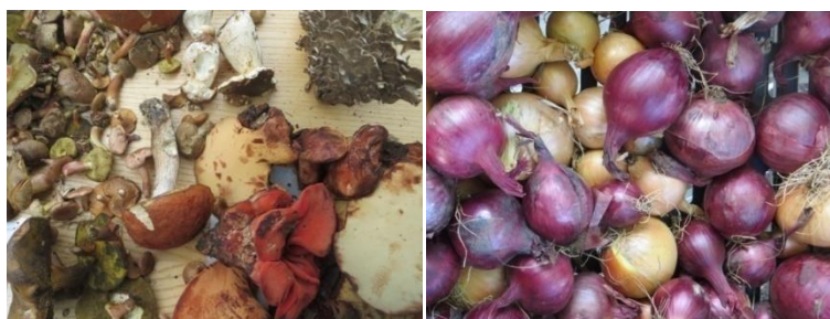
Mushrooms, other fungi, and onions. Above all it is so good for children to see – and to touch, taste and understand – where real fresh food comes from, in its astounding colours, shapes and sizes