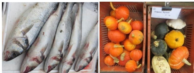
Sea bass caught by the fishing boat 'Our Betty' on England's south coast (left) and varieties of squash and pumpkins (right) grown from seeds not used for commercial supermarket produce

My work involves a lot of foreign travel, and when I come home I need to ground myself. After cleaning the kitchen, I head to the market on Saturday morning to stock up for the week. This feels good on several counts. I touch, smell and purchase good-looking, wholesome foods from people who grow them. The mood is festive, we chat and exchange news, I bump into friends, sit for a while. I am supporting those determined to live on the land. It is satisfying to play my part in this benign cycle, instead of taking the dead easy option of going to the supermarket. Instead many of us now think small. The market's rules are simple but profound. All food sold here must be environmentally sustainable (defined as produced through organic or biodynamic farming); part of a small-scale operation; locally sourced; seasonal; and fairly traded. Also all the food must come from within a 70-mile radius.