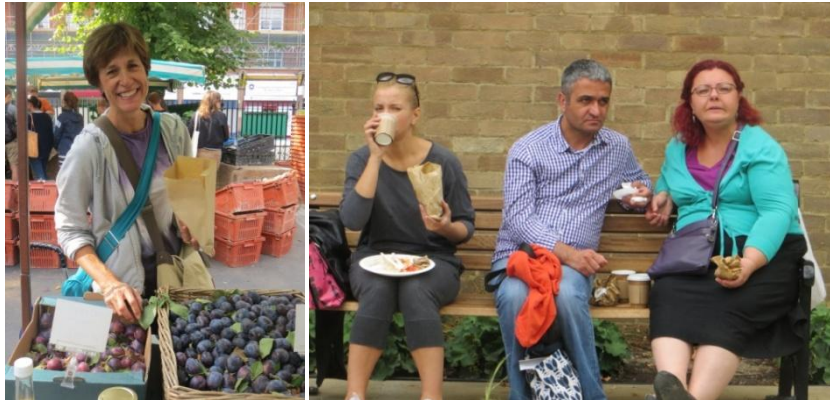
Me (left) buying damsons for a supper with a visiting friend and family. We ate them lightly stewed with raw cream from another stall. At the market people eat, drink, meet, and make friends.