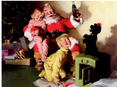
Designing food for children...