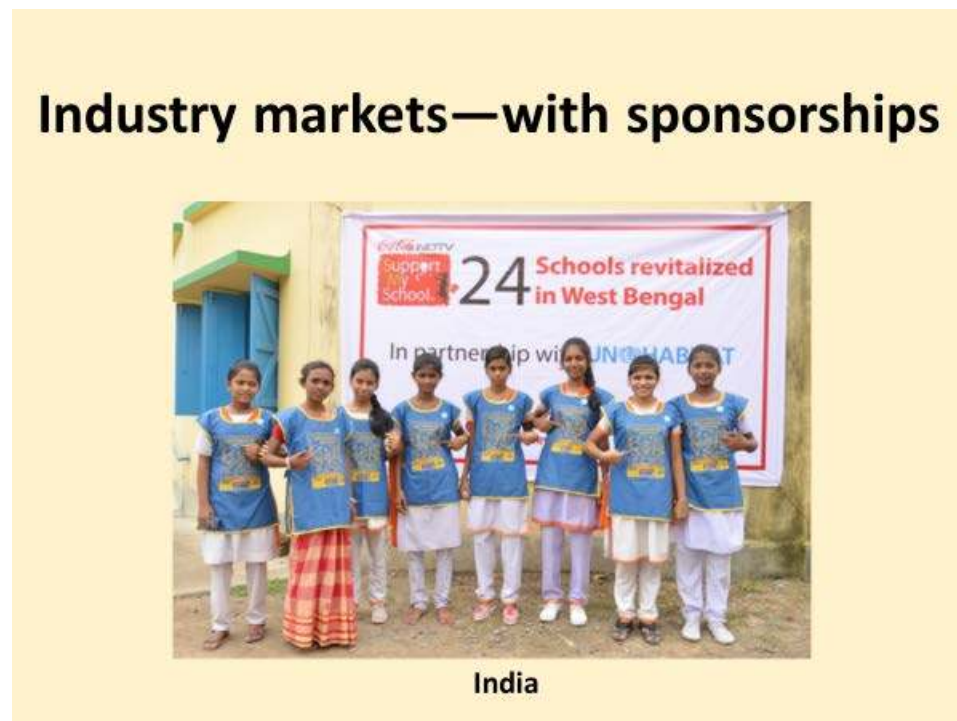
Figure 3. Coca-Cola marketing via sponsorship in India

Companies like Coke don't just use advertising to sell products. Rather, they insert themselves into a country's daily life to both bolster their reputations—and to sell more soda. The most obvious thing is plastering their brand names everywhere. A more subtle approach is sponsorships. Companies sponsor all kinds of good causes, especially related to women, sports, education, and the environment. But underneath that veneer is marketing—and plenty of it! Figure 3 shows just one little example from India.