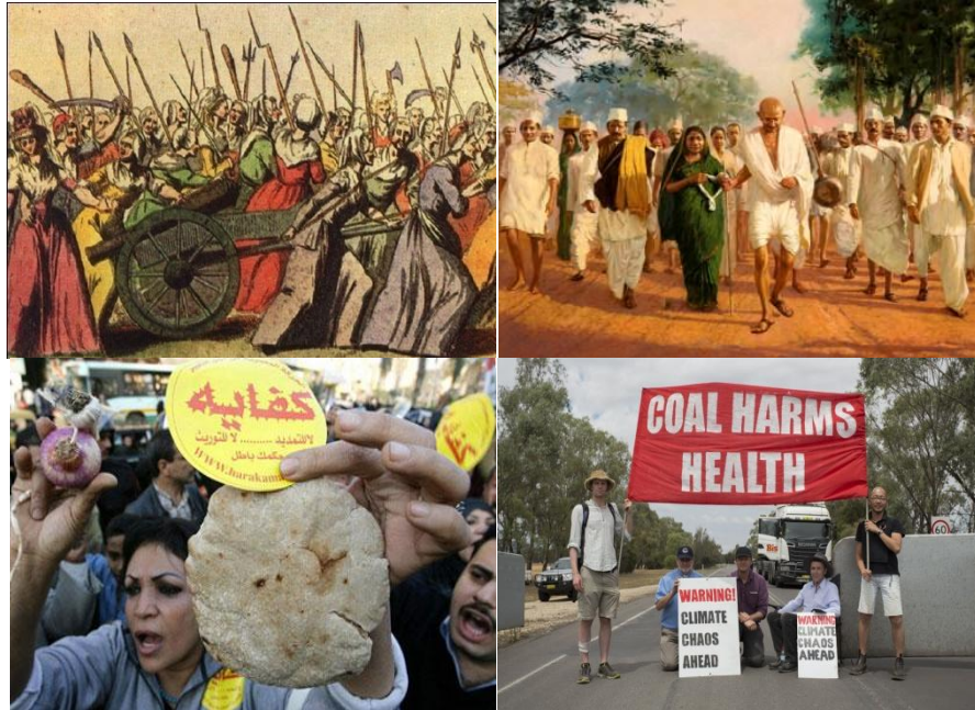
Direct action on food. Bread riots, Paris, 1789. Mahatma Gandhi's Salt March, India, 1930 Bread riots, Egypt, 2013. Colin Butler protesting against coal mining boost, Australia, 2014

The Issue team writes: The pictures above illustrate that food (or crises over price or availability) often cause non-violent civil disobedience, riots, uprisings, or even revolutions. The French Revolution started in 1789 with bread riots. Mahatma Gandhi challenged the British Raj tax on salt with a march in 1930 to make salt followed by savage police brutality. The 'Arab Spring' started with bread riots in Tunisia and in 2013 continued in Egypt with riots against official advice to eat less.