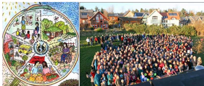
The permaculture model of sustainable society (left) originated in Australia, is practised worldwide. A long-established largely self-sufficient community is in Findhorn in the North of Scotland (right)

Caring in any community is strengthened when people – adults and children – choose to spend more time working and playing together. Social interaction can be enhanced through the ways in which businesses and recreational and cultural activities are organised. Hunger is less likely in communities with more social activity of any type. The risk of going hungry will be especially low if there are many food-related activities carried out by groups.