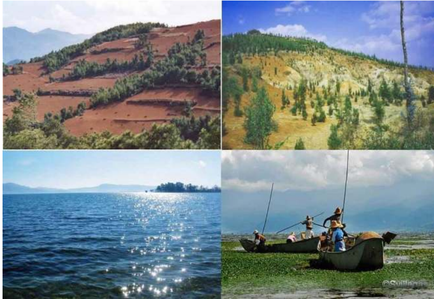
Landscapes in Yunnan. (Above) stable, cultivated terraced slopes contrast with badly gullied slopes, (Below). The clear waters of lake Erhai before 2001 contrast with more recent algal contamination

In some localities, slow deterioration has now become a vortex – a rapid downward spiral. Some aquatic ecosystems have dropped over tipping points into new states where clear lakes suddenly become dominated by green algae with losses of high-value fish. These states frustrate continued high-level production of crops and fish, and they are very difficult and expensive to restore. Natural processes are degraded and destabilised to the point that they cannot be depended upon to support intensive agriculture in the near future. The whole region is losing its ability to withstand the impact of extreme events, from typhoons to global commodity prices.