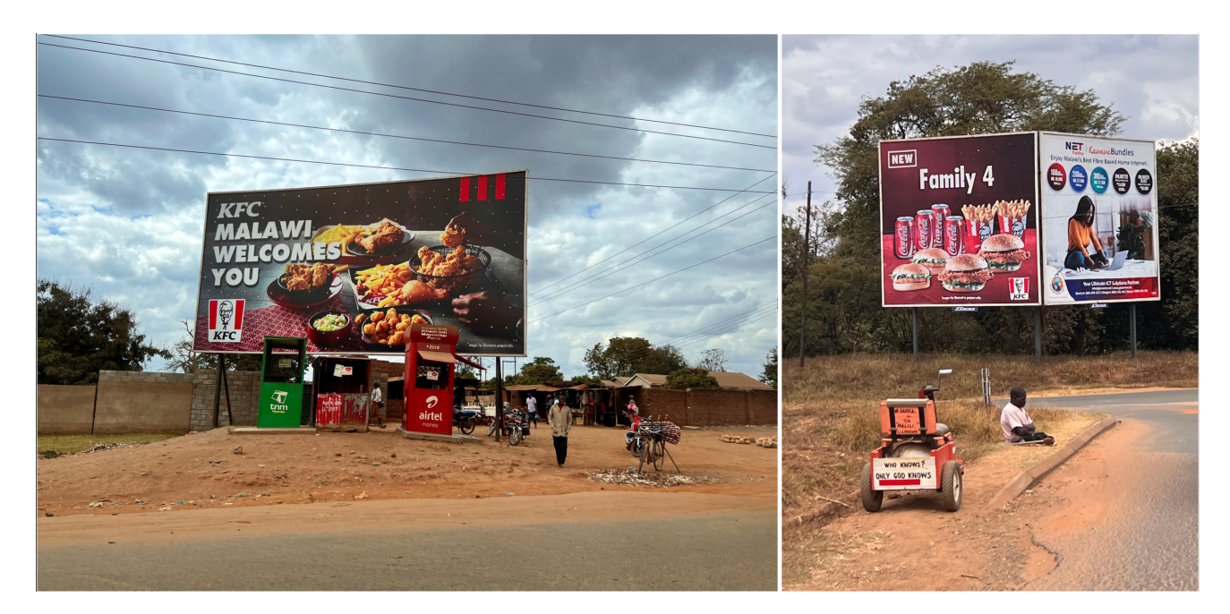
Figure 2. Views from the road, Lilongwe, July 4, 2023