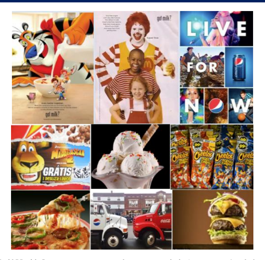
The World Health Organization is committed to partner with the 'private sector', code for transnational corporations, including in initiatives that are supposed to end childhood obesity

May is the month of the WHO World Health Assembly. The 68th WHA takes place this year in the week between Monday 18th and Tuesday 26 May. In this issue WN considers two topics on the minds of WHO officials and representatives of WHO member states this year. One is 'engagement with "non-state actors" and in particular 'the private sector'. The other is the WHO Commission on Ending Childhood Obesity, or ECHO. These relate. In practice, what 'the private sector' means, is transnational food and drink product corporations and their trade and front organisations. Thus, as explained by a WHO official, 'the member states have mandated WHO to work with the private sector and therefore they [ECHO] are working within their mandate when they engage with the private sector'. Meaning, that partners in UN work to end childhood obesity include Coca-Cola, Pepsi-Co, Kelloggs, Nestlé, and other purveyors of ultra-processed energy-dense fatty or sugary products aggressively advertised to children. This bizarre situation has been described as 'sleepwalking with the enemy'.