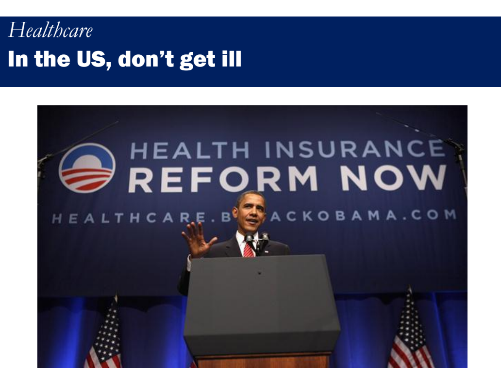
Since Barack Obama's Affordable Care Act, the uninsured rate has dropped, but US families of four still pay a yearly average of $16,351 for healthcare insurance that offers shoddy coverage

A consequence of a government that serves the interests of the few can be seen in the ludicrous healthcare system in the US. When I describe this in Europe, most people think I'm exaggerating, lying, or completely misinformed when I tell them some of my favourite facts. For instance, an average family of four has a yearly insurance premium bill of $US 16,351 (with luck, an employer of a full-time worker will pay about 70%, leaving the family to contribute $4,565 for health coverage). Prices for a minute's ride in an ambulance can cost upwards of $3,000.