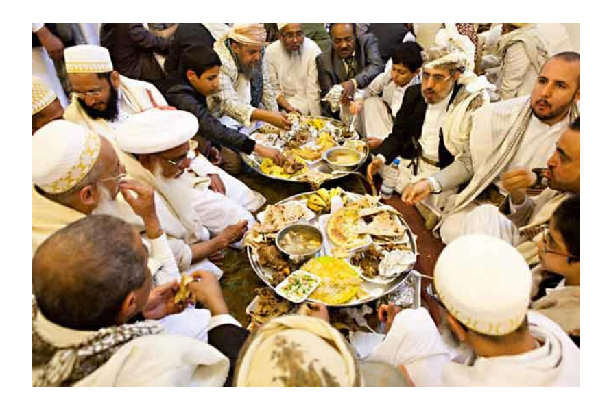
Another characteristic of traditional eating habits is commensality — the sharing of meals by families and friends, and often, as here, preparation of many dishes, mostly made from foods of plant origin

now become very high. For example, nearly one-third of the dietary energy consumed in France is of animal origin (4). Many people seem sceptical about vegetarianism. (Meaning, not eating meat – red meat, poultry, seafood and the flesh of any other animal – a stricter version of which is also avoidance of by-products of animal slaughter). But the respective share of animal and plant products in the human diet is now of paramount importance, to ensure adequate food availability for a fast-growing global population, to optimise the relationship between diet and health, and to reduce the ecological impact of agriculture and livestock (5,6).