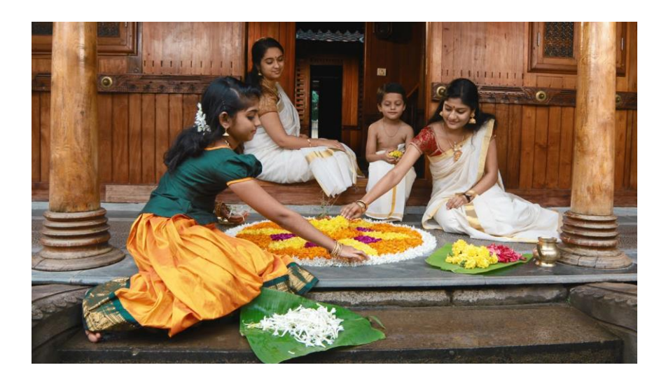
Traditional plant-based cuisines from all over the world also typically show a rich variety of colours, flavours and textures, from many types of food, made even more attractive by beautiful presentation

In addition to providing healthy types of carbohydrate, varied plant-based diets are more than adequate in protein and essential fatty acids. Populations whose diets are centred on animal foods consume an unnecessary amount of protein – perhaps around 90 grams a day, whereas 50-60 grams is fully adequate. It is still sometimes said that animal foods supply complete protein whereas plant foods do not. This is not true, as long as grains (cereals) are balanced with legumes (pulses), as they normally are in traditional plant-based dietary patterns all over the world. Lack of a complete range of essential amino acids is a problem only when plant-based diets are monotonous and based on grains such as wheat, rice, corn or millet.