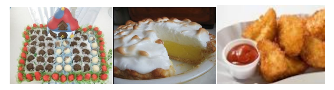
Three sources of trans fats: pre-prepared candies (confectionery) and also packaged cakes; ready-made fried fatty products: mostly, branded products

In 2009, a World Health Organization (WHO) scientific committee recommended the 'virtual elimination' of trans fats from all food supplies (1). This recommendation replaced the 2003 joint WHO and Food and UN Agriculture Organization (FAO) report recommendation that advised countries worldwide to limit their population intakes of industrially produced trans -fatty acids (hereafter, trans fats) to less than 1 per cent of total calories a person a day (2). (For the sources of trans fats, and the harmful effects of these type of fats on human health, see Boxes 1 and 2).