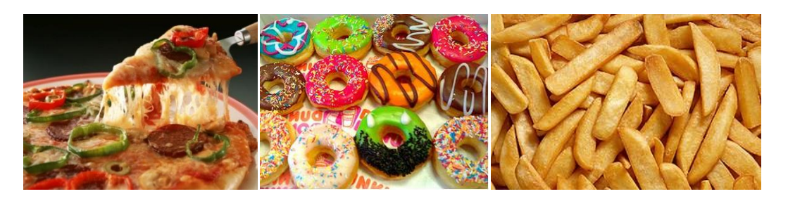
Three sources of trans fats: ready-made pizzas; baked goods like cookies (biscuits) and donuts; and French fries (chips): mostly, branded products

Here are some of the consequences of populations and people consuming artificial industrially-generated trans -fatty acids ( trans fats) in food products: