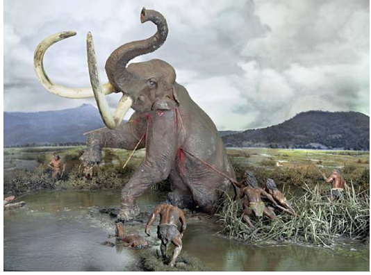
Left: 'The free market' is an odd name for a political and economic ideology whose practice involves global child labour, as here in Andhra Pradesh, India. Right: 'Hunter-gatherer'. Are we really sure that the palaeolithic diet humans are evolved with was mainly hunted by men, rather than gathered by women?

But what "the free market" actually refers to is a political and economic system in which regulation of business is minimal or absent. The freedom is for those who are thus best able to increase their wealth and power. "The free market" is in fact, unrestrained capitalism, of the type that drives prices down and profits up by use of child labour in impoverished countries' – as illustrated in the picture above, left.