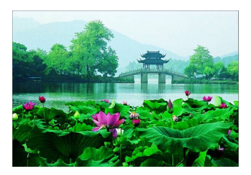
Left: 'Developing country' does not hit the spot, used for China with its 4000 years of continuous civilisation, as exemplified here on Hangzhou's West Lake

As a third example, these days 'developing' and 'developed' country tends at last to be set aside, in favour of 'low/middle/high income country'. A recent visit to Hangzhou in China (above) is a reminder of the absurd insult of 'developing' country. Read more in 'As I see you' – the link is above.