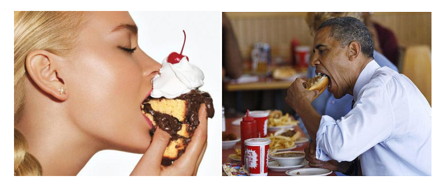
Public health professionals too often use the term 'industry' to refer to the manufacturers of energy-dense fatty sugary or salty ultra-processed products

The last of this initial list of six bad words and terms, is 'the food industry'. Public health professonals shoot themselves and their cause in the foot, when they refer to 'the food industry', or even just 'industry', as a dark force. Just as we all need food, and – if we are relatively wise or fortunate – can enjoy wonderful delicious healthy meals, civilisation itself is dependent on and indeed partly defined by industry. After all, to be 'industrious' means to be active, lively, energetic.