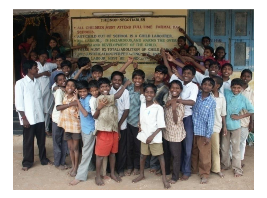
'The free market' really means currently dominant political and economic ideology involving global child labour, shown here in Andhra Pradesh, India