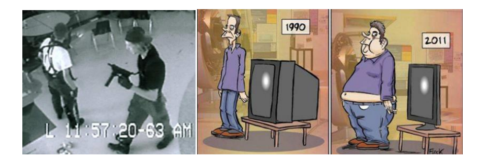
Images of 'development'. Boys who buy guns and whose killing of children is filmed on surveillance systems; and people who get fat on television and junk

What 'developing' as in 'developing country' actually means, is a country whose people on average use relatively little money. In such countries a high proportion of the population may be really impoverished. Or, they may be peasant farmers who live well and don't need much money. In 'developed' countries a high proportion of people use lots of money, which may enrich their lives. But all expenditures go to 'develop' a country. Such purchases include those by adolescents on guns with which they kill other children (below, left), recorded on surveillance systems whose price is more 'development'; and on successive electronic development, and more and more ultraprocessed food products that cause obesity (below right), which is also more 'development'. Maybe we should instead say 'thin' and 'fat' countries. Let's at least stay with 'economically developed' and make a point of reminding everybody, including ourselves, that economic development is not the way to instant bliss, and is the engine driving climate change and environmental devastation.