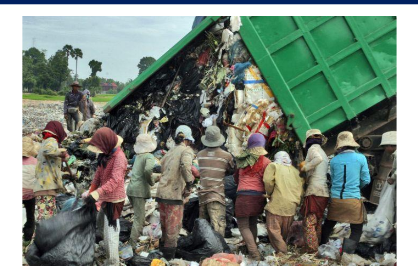
'Lifestyle'? This doesn't hit the spot, to refer to the ways of life of the tens of thousands of families who live on rubbish dumps, like these in Cambodia

Here is another general term constantly used in the context of public health nutrition: 'lifestyle'. These days there are even professors of 'lifestyle'. This is true! If any reader knows of a report on obesity or chronic diseases published after the mid 1980s in which this word is not used, do tell, using the address at the end of this editorial.