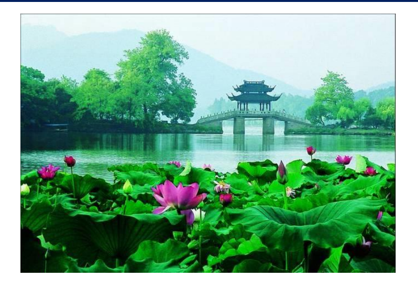
The West Lake in Hangzhou, the capital of China 800 years ago. 'Developing country' is a bad name for a country with 4000 years of continuous civilisation

A recent visit to Hangzhou in China (its West Lake is above) reminded me of the crass insult of 'developing country' as applied for instance to China. In the Southern Song dynasty of 1127-1279 CE, fairly close now to a thousand years ago, Hangzhou was this great country's capital. We know what life there was like then, because the Venetian