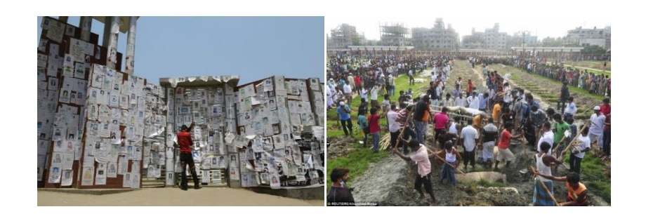
Bangladesh, April. Over 1,100 textile workers killed. Pictures of the missing and dead, and mass burial of the dead. A consequence of the 'free market'

'If you want to know what "the free market" means', an Indian colleague said to me, 'look at these'. She was referring to photographs taken in Savar, near Dhaka in Bangladesh, after 1,127 workers were killed in the collapse of a clothing factory on 24 April. You read about it, I'm sure. Above are two of the photographs, showing pictures of the dead and missing posted on walls, and of burials in mass graves.