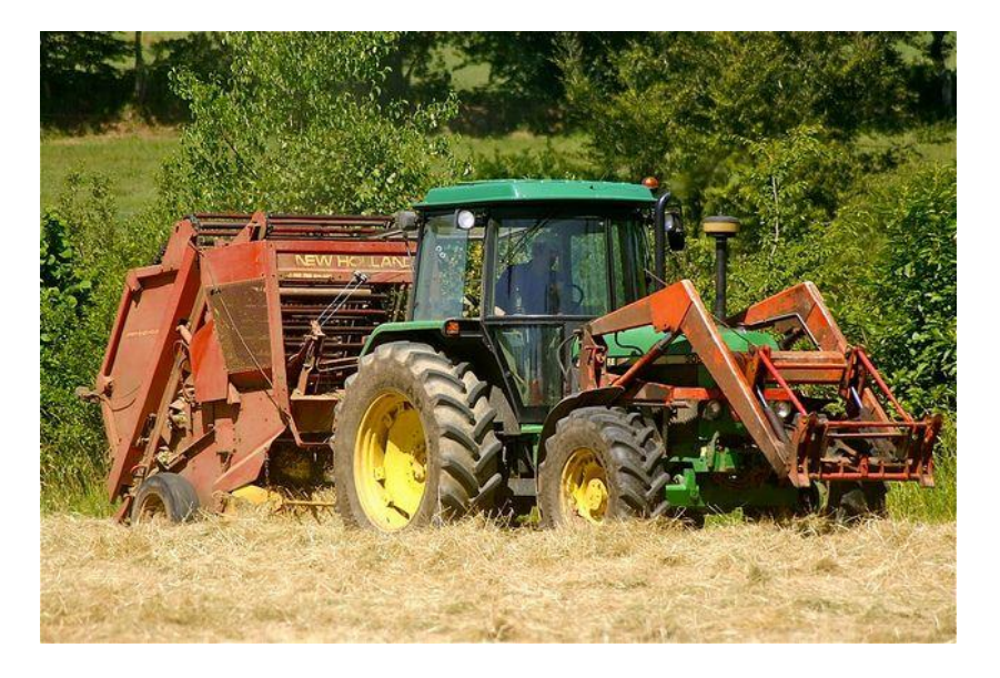
But the food industry also includes producers of good fresh food, like peasant agriculturalists and family and co-operative farmers in all parts of the world

Let's make and follow a rule, of making the sharpest and clearest distinction between the products consumed by the glamorous model and the current president of the USA (pictures above), and the produce created by farmers who work on their land (picture below). If all this column does, is to get this message received, understood and acted upon, please, my own labours will be rewarded. Thank you!