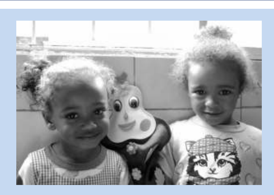
Good education encourages people to make conscious choices. Two children at a day care centre in Juiz de Fora, Brazil, being oriented for nutrition education using pedagogical methods