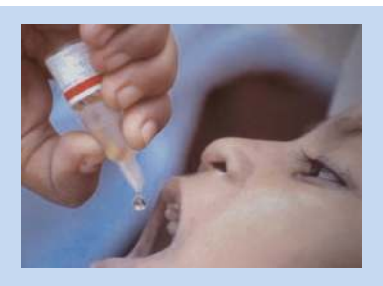
Food and nutrition aid to impoverished countries and communities is vital in cases of actual hunger or deficiency (as of vitamin A, above) but does nothing to address structural causes