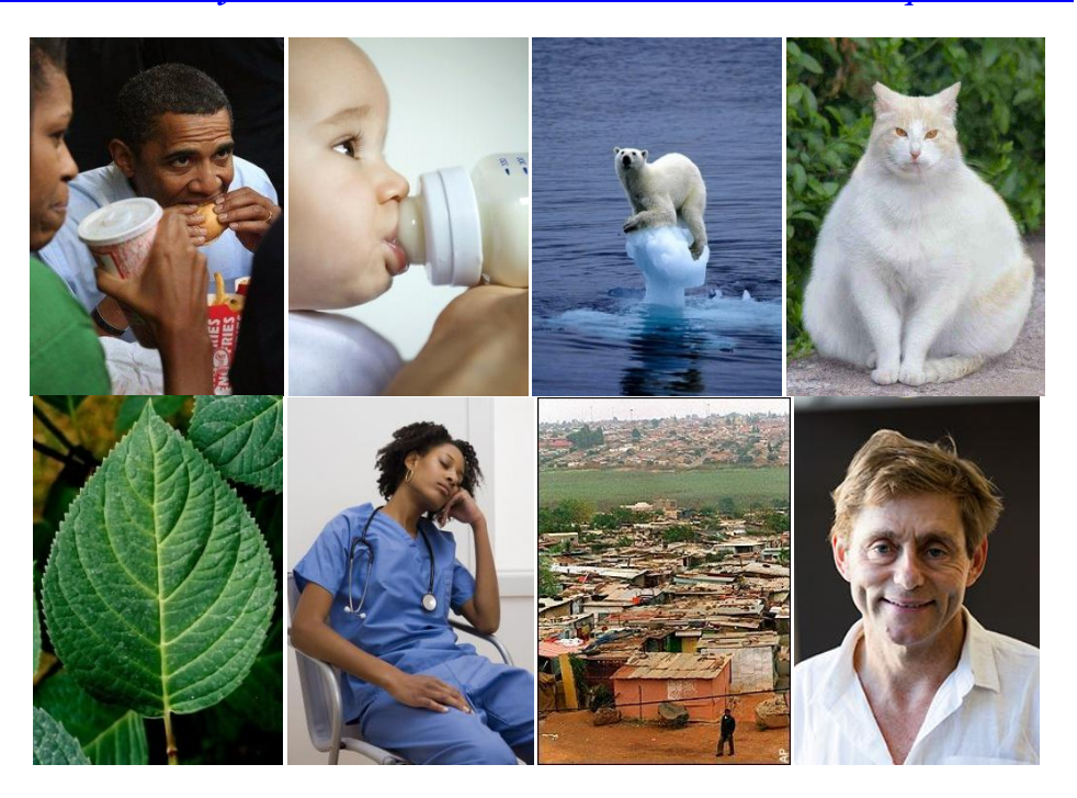
What do burgers, hottle-feeding, climate disruption, fat cats, the nitrogen content of plants, night shift work, and poverty, have in common? The Protein Leverage Hypothesis, and David Raubenheimer

Access Appetite May 2012 David Raubenheimer et al on protein here Access December 2012 Carlos Monteiro et al Food System position paper here Access 2014 British Journal of Nutrition David Raubenheimer et al on protein here