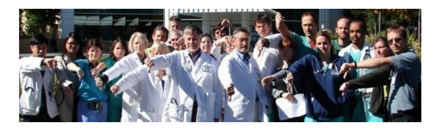
2009. 'Appalled and ashamed', 20 courageous physicians rip up their membership cards and resign from the American Academy of Family Physicians, protesting AAFP partnership with Coca-Cola