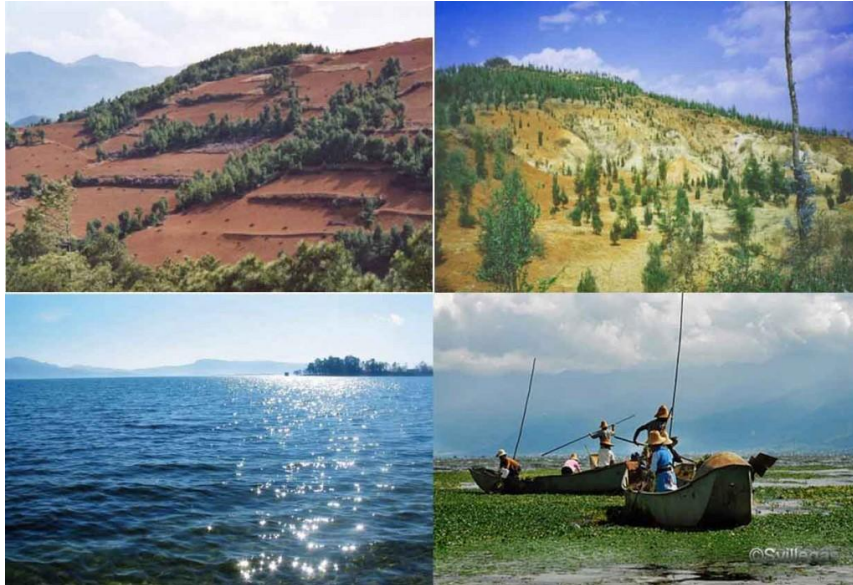
Landscapes in Yunnan. (Above) stable, cultivated terraced slopes contrast with badly gullied slopes, (Below). The clear waters of lake Erhai before 2001 contrast with more recent algal contamination

In some localities, slow deterioration has now become a vortex – a rapid downward spiral. Some aquatic ecosystems have dropped over tipping points into new states where clear lakes suddenly become dominated by green algae with losses of high-value fish. These states frustrate continued high-level production of crops and fish, and they are very difficult and expensive to restore. Natural processes are degraded and destabilised to the point that they cannot be depended upon to support intensive agriculture in the near future. The whole region is losing its ability to withstand the impact of extreme events, from typhoons to global commodity prices.